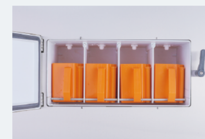
▶ Kingstar Industrial Automatic Washer Extractor Add Detergents

The machine adopts down suspended shock absorption design, inner and outer double-layer seat springs+rubber shock absorption springs and machine feet rubber shock absorption and four damping shock absorption structure design, ultra-low vibration, shock absorption rate can reach 98%, Without ground base, can be used on any floor.