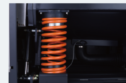
▶ Kingstar Industrial Automatic Washer Extractor shock mitigation system.

The machine adopts down suspended shock absorption design, inner and outer double-layer seat springs+rubber shock absorption springs and machine feet rubber shock absorption and four damping shock absorption structure design, ultra-low vibration, shock absorption rate can reach 98%, Without ground base, can be used on any floor.